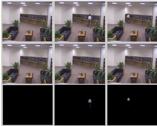
Fig. 3. Robust video recovery as robust tensor PCA. The first row are the 3 frames of the original video sequence. The second row are the recovered background, and the last row are the recovered foreground.

reduces to the traditional mode- n matricization. Most results in this paper, including CP-rank approximation and low-M-rank tensor recovery, can be easily generalized to odd-order tensors.