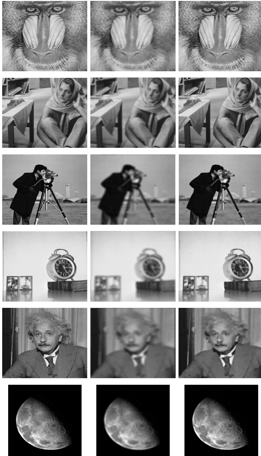
Figure 2: Results on the images (top to bottom): “Baboon”, “Barbara”, “Cameraman”, “Clock”, “Einstein” and “Moon”. First column is the original images, the second is blurred and noisy images, and the third is the restored images by Algorithm 1 with (\tau, \theta) = (0.8, 1.12) .